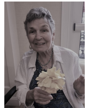
The Arbors at Dracut Senior Spotlight