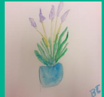
Painting by Beatrice T.

FAUX STAINED GLASS: Traditional community residents created these beautiful tree images, which really pop when lit from behind, hanging on a window. We tore tissue paper into shapes and glued them to wax paper. Next we cut out trees from black construction paper. To complete our faux stained glass hanging we framed them in black paper.